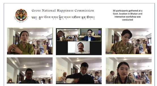
"Design Clinic for The Bhutan Government"