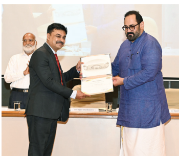
"Recognition by Government"