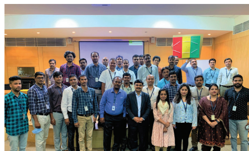
"Solutions for the Pharmaceutical Company"